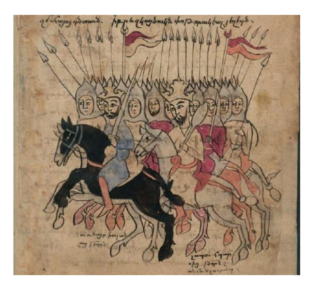
Fig. 1. Urnayr and Shapur in the battle of Bagavan (Ms. Berlin SBB, Or. quart. 805, fol. 212r)